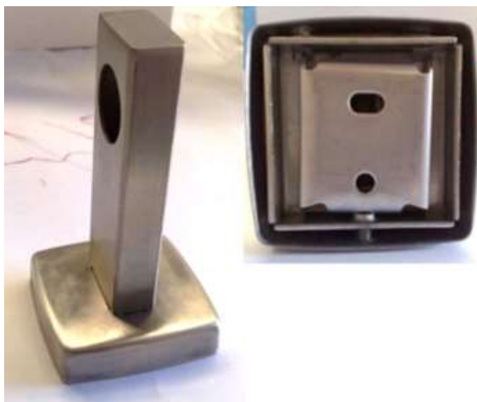
*Rear View of Cover Flange & Mounting Arm, showing position of Concealed Wall Plate.